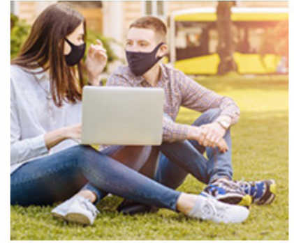
Essay mills 'targeting students' as pandemic crisis shifts HE online